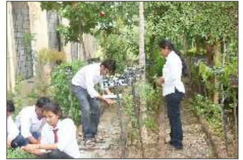
Medicinal Plant Garden: Tree Plantation