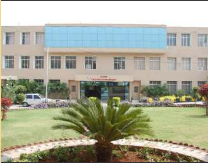
Alard College of Pharmacy

Approved by AICTE & PCI, Affiliated to Savitribai Phule Pune University, Pune Recognised by DTE (Govt. of Maharashtra)