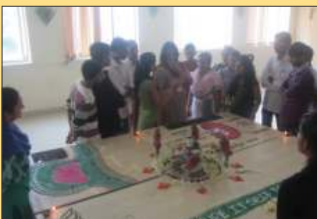
Scientific Decoration Competition