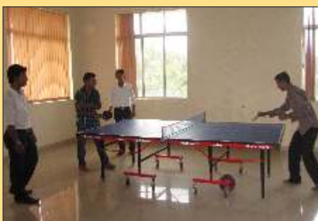
Indoor Sports (TT)