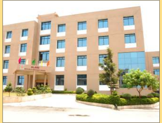
Alard Institute of Management Sciences