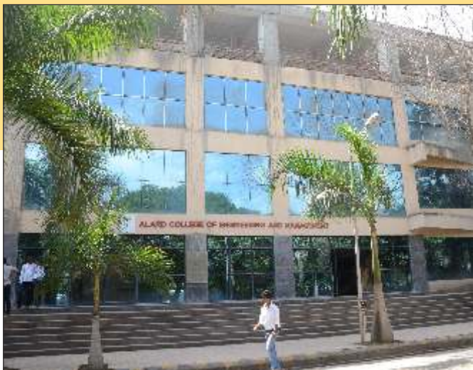
Alard College of Engineering and Management