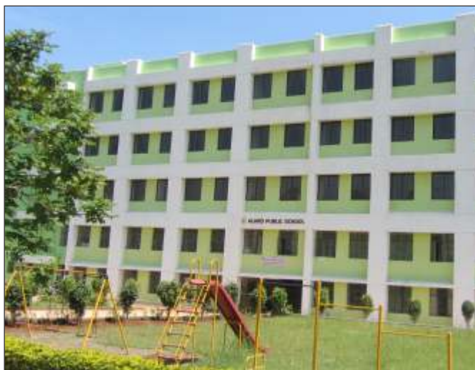
Alard Public School (CBSE Board)

We will find a way ..... .....Or we shall make one