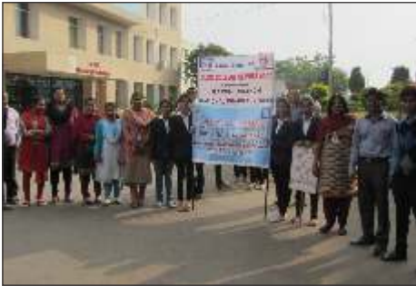
Pharma Rally : NPW Celebration

The world is continuously changing restructuring and metamorphosing every day with invention in every field of life sciences, industrial development etc. The professionals in the forefronts of these changes are pharmacist and technologists.