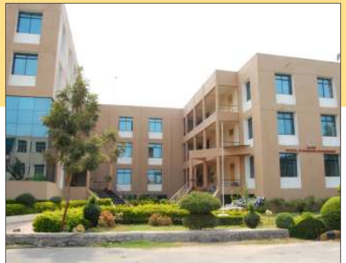
Alard School of Business Management