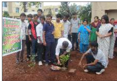
Tree Plantation on Guru-Poornima