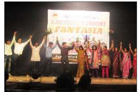
Annual Day Celebration : Fantasia